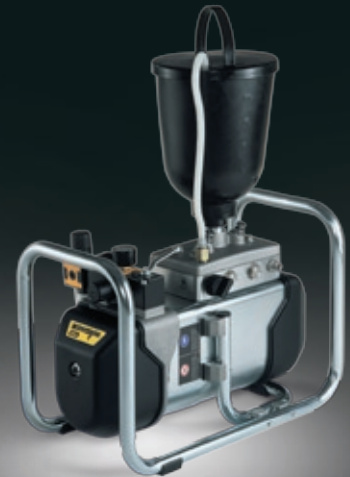
Double diaphragm pump